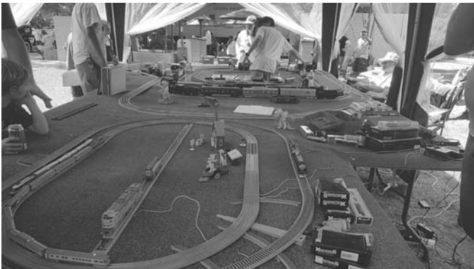
Two Portable Layouts brought in for the day. After all, SWD members operate toy trains !