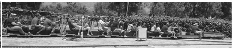
Left: the "tail end" of the cars in picture above pulled by the diesel engine on the right. Everyone enjoyed taking a train ride on the Live Steamers' tracks.