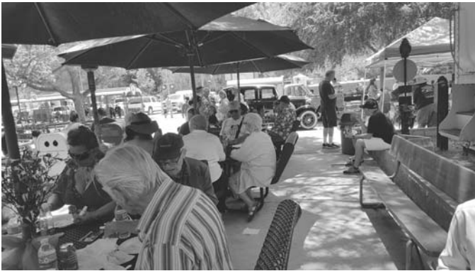
Good group chowing down in the shady eating area. Note Model Ford in background.