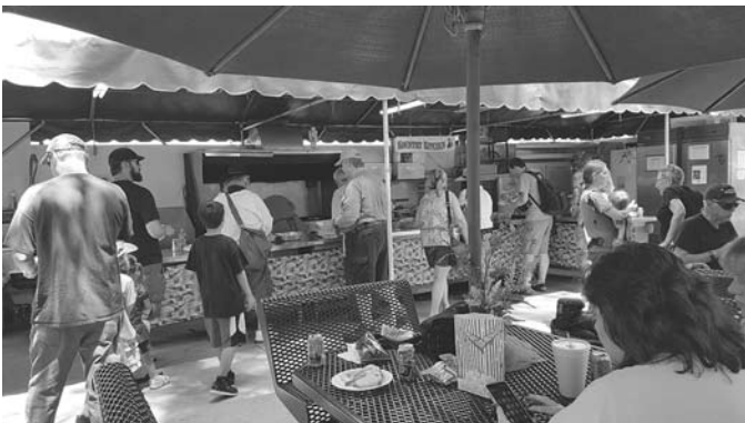
Members and friends visited the Kountry Kitchen for hamburgers, hot dogs and all the trimmings, plus potato salad, veggies, chips, cookies, water and soft drinks.